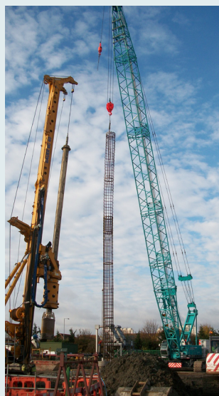
Record length: A 29m rebar cage

At 11m deep, there is a need for a compression ring and it is here that the first section of half thickness permanent concrete lining will be cast just before Christmas to double as a temporary works beam. Two further similar beams are needed at 16m and 20m depths. Aecom is Murphy’s permanent works designer.