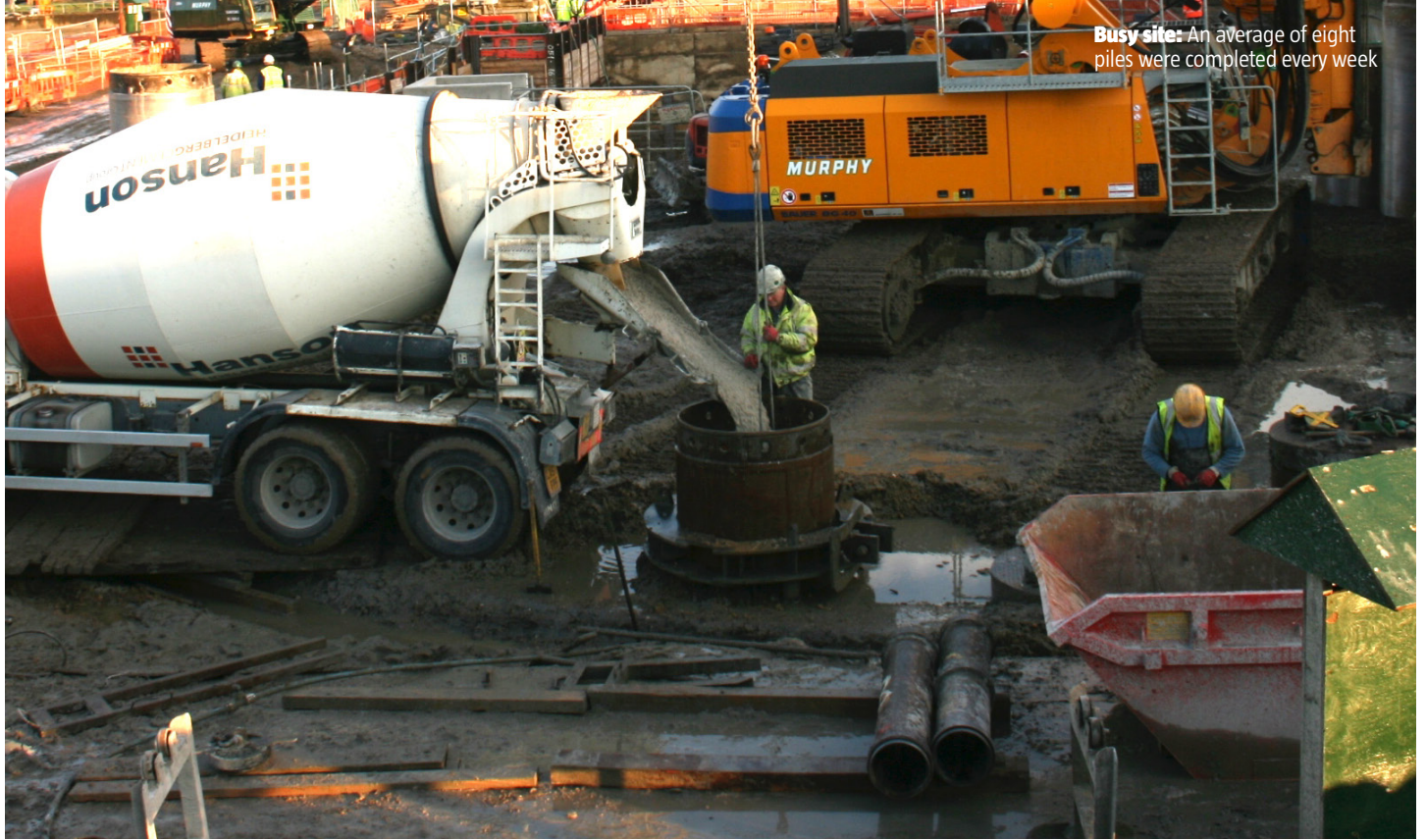
Busy site: An average of eight piles were completed every week

A decision to install a massive secant piled retaining wall to form the perimeter of a sewage treatment works' inlet pumping station shaft has cut temporary works costs by 20%. It has also slashed a valuable five weeks off the construction programme at the North London project.